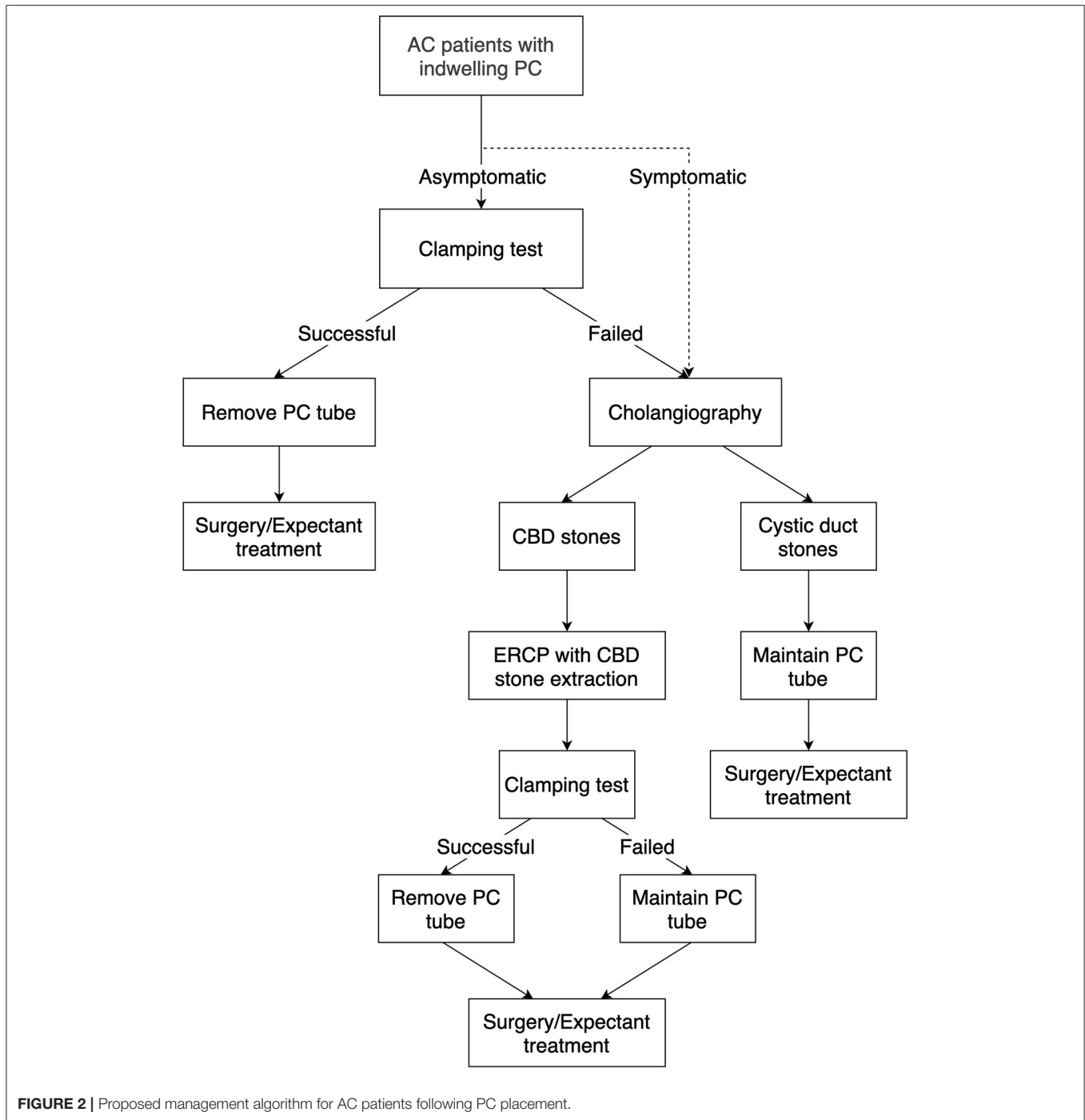
FIGURE 2 | Proposed management algorithm for AC patients following PC placement.

test as a screening tool prior to cholangiography may be a novel approach in patients suitable for PC tube removal (Figure 2).