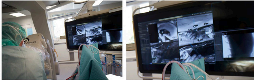
FIGURE 1 | (Left) Picture showing a surgeon from Karolinska hospital in Stockholm using a hybrid operating room with an augmented reality system integrated with the robotic C-arm. (Right) The surgeon is seeing at the screen the video streaming of his surgery with a blue line indicating the direction of his instruments that he is navigating into the pedicle.

the tracking system and transforms the input into images, which are sent to the display system, where the combination with the view of the real scene takes place (13, 15, 16). The display system could be head-mounted (5) ( Figure 1 ).