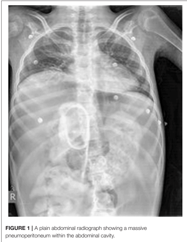
FIGURE 1 | A plain abdominal radiograph showing a massive pneumoperitoneum within the abdominal cavity.

We report here a case of gastric necrosis and perforation due to massive gastric dilatation caused by PA in a 13-years-old mentally impaired girl. We also surveyed the literature on this rare condition and discussed the preventive actions that could hamper the fatal outcome.