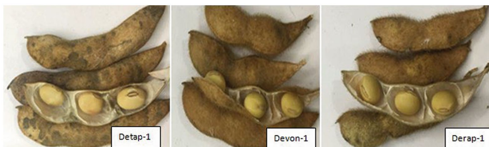
FIGURE 1 Seed shape, hilum color, and pod color for Detap-1, Devon-1, and Derap-1 varieties.

In this study, the primary pests affecting soybeans were identified as S. litura , R. linearis , and E. zinckenella . The attack of the S. litura borer (Table 1) on the Devon-1 variety had the lowest attack compared with Detap-1 and Derap-1. This aspect is different from the attack of the pod borer E. zinckenella and R. linearis , where Derap 1 has the lowest attack and is significantly different from the other varieties. The difference in attack on these varieties can be caused by several factors. In observing the length of the trichomes and the number, the varieties showed significantly different results. Detap-1 treatment had the longest average trichomes, and Derap 1 had a lower density than the other two varieties, such as 57.27 per