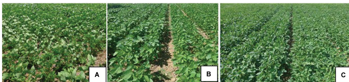
FIGURE 5 Farmers transplanting method (A), method of transplanting double rows (B), and method of transplanting three rows (C).