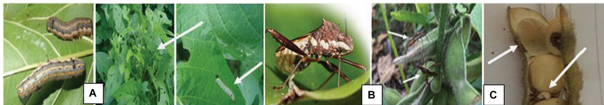
FIGURE 4 Spodoptera litura F. (A), pod sucker Riptortus linearis F. (B), and pod borer Etiella zinckenella T. (C).

The numbers followed by the same letter in the same column were not significantly different according to Duncan's test at the 0.05 level.