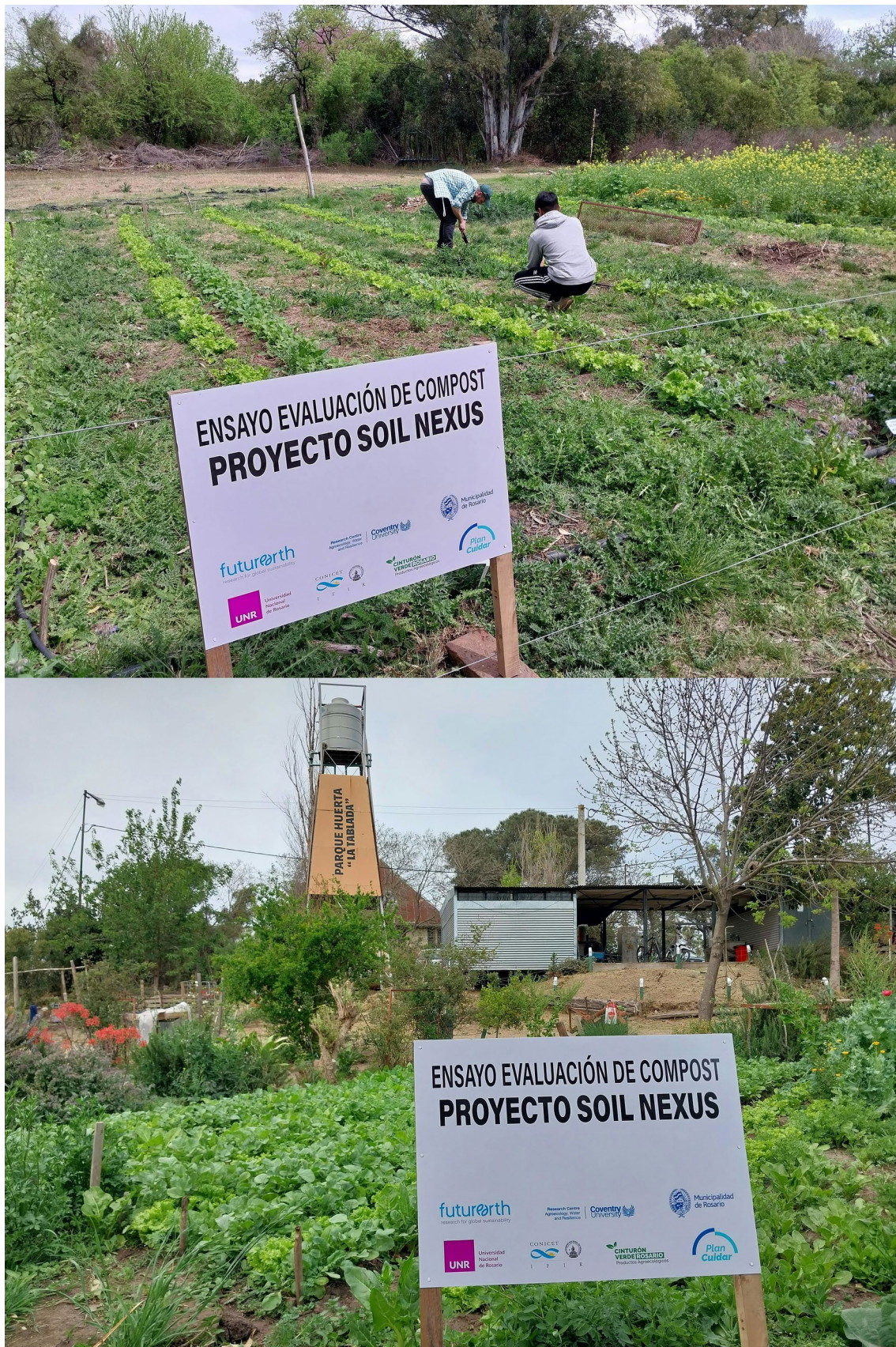
FIGURE 1 Essays of the compost evaluation were performed at the urban agroecological park La Tablada (top), and at the periurban farm Trabajo en Tierra Vida (TTV) (bottom), both at Rosario city, Argentina.