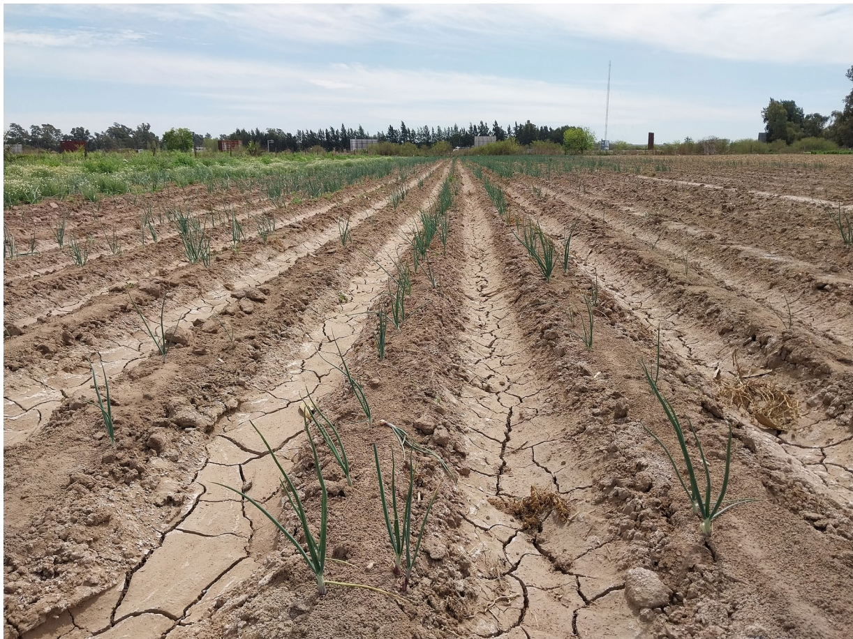
FIGURE 2 Degraded soil in the Rosario Greenbelt.

In order to evaluate the suitability of the resulting compost as a valid input for the production of organic food, several analyses were