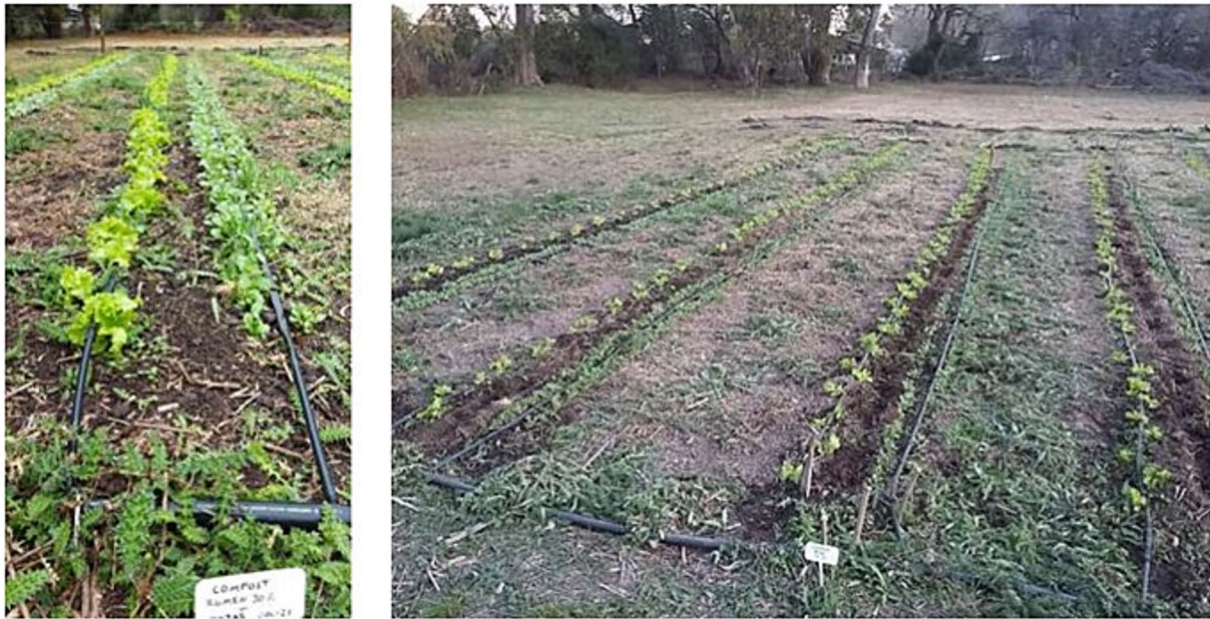
FIGURE 5 Details of the placement in the soil of the lettuce and radish at periurban farm TTV and of the irrigation system.

production, but no chemicals were being used prior to the study. In both locations and for all growing cycles, the radish crop was begun by planting controlled seeds and the lettuce crop was started by transplanting seedlings (procured from a conventional non-agroecological supplier, as producers usually do) to the chosen location. The idea was to reproduce the situation that it is most common in the use of seeds and transplanting seedlings.