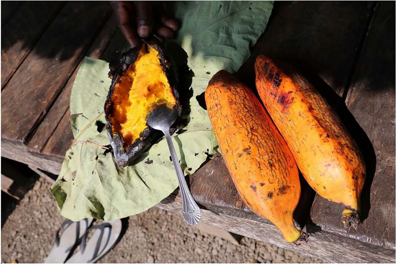
FIGURE 2 | Image of Solomon Islands banana. Left: A cooked banana opened to show rich colored flesh. Right: Fresh, unpeeled banana (Image courtesy Jessica E. Raneri, 2021).

underutilized and could be considered the “forgotten” crop of the Pacific.