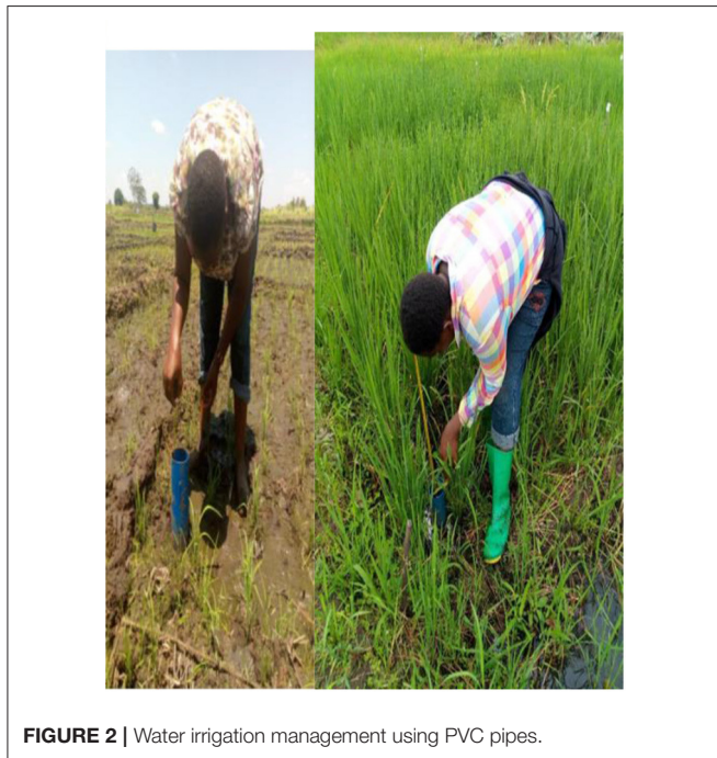
FIGURE 2 | Water irrigation management using PVC pipes.

Values in parenthesis under the plant density column are number of hill per unit area (m 2 ) in respective plots.