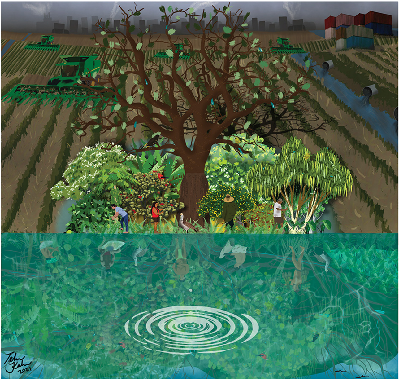
FIGURE 3 | Practitioners' values and resulting agroforestry practices, based in relationships and reciprocity, conflict with dominant institutions and systems of resource access in Hawai'i that value short-term production and economic profit. These contested values and an imbalance in power between practitioners and landowners, government agencies, policymakers, and other institutions cause agroforestry practitioners to fall through the cracks. This illustration depicts how the conflict of values and power is like a tree whose top has been cut off and a new top grafted on, but the two trees (value systems) are incompatible, so the grafted tree struggles to survive and never produces fruit. Many Indigenous and local practices of agroforestry (area below the graft wound) are rooted in ancestral knowledge (roots and reflection below ground) and are impeded by the values of the dominant regime (grafted top). Some Indigenous and local practitioners are able to circumvent obstacles (push past the graft wound), yet structural change is needed to create more equitable access to participation and enable more just agroforestry transitions. Artwork by Tehina Kahikina.

illustrated in our interviews, the cultural norms and policies of these same institutions are still largely siloed and favor short-term production and economic value, which constrain agroforestry practitioners. Agroforestry in principle belongs to all sectors, but in practice, it belongs to none (Buttoud, 2013). This contradiction challenges inclusive participation in agroforestry. Further, many interviewees viewed the term