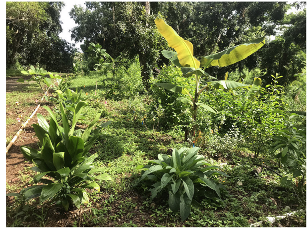
FIGURE 1 | Practitioners in Hawai'i integrate trees and shrubs with other plants and animals in agroforestry systems ranging from cacao and windbreak systems, to multi-story forests including a range of native and non-native plants for multiple products, to silvopasture with native trees and cattle. Pictured here is an example of a multi-story agroforestry plot in the establishment phase at Kāko'o 'Ōiwi, He'eia, O'ahu. Key visible plants include a native, culturally important tree, wiliwili ( Erythrina sandwicensis ); Polynesian introductions ti ( Cordyline fruticosa ) and mai'a iholena lele ( Musa sp.; banana); and an introduced medicinal plant, comfrey ( Symphytum officinale ).

The practitioners represented 31 sites—families, businesses, or non-profit organizations with land access. The median land area each site tends using agroforestry is 10 hectares, excluding one site that tends over 405 hectares. Over half of the sites are on Hawai'i Island. Sixty-one percent of sites own or co-own the land they steward. Of the 39% of sites that rent land, most of them (67%) lease from the state's largest private land owner, Kamehameha Schools. The majority of practitioners gained access to former plantation agriculture or ranching lands that were fallow and transitioned from non-native grasses, shrubs, and/or trees to agroforestry. Only four practitioners