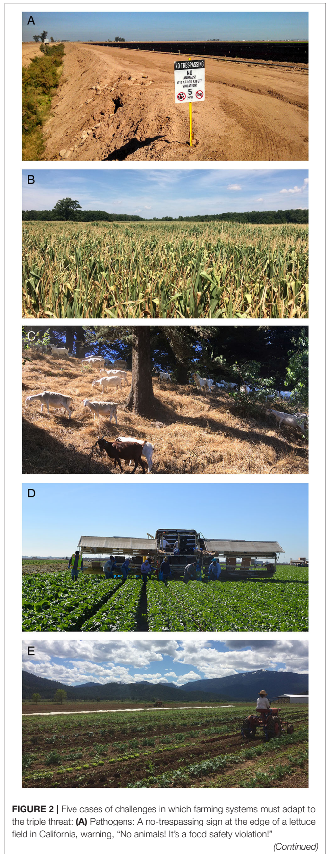
FIGURE 2 | Five cases of challenges in which farming systems must adapt to the triple threat: (A) Pathogens: A no-trespassing sign at the edge of a lettuce field in California, warning, “No animals! It’s a food safety violation!”

We do not expect most readers to read every case. Rather, we present a diverse palette of cases as self-contained applications of the framework from which