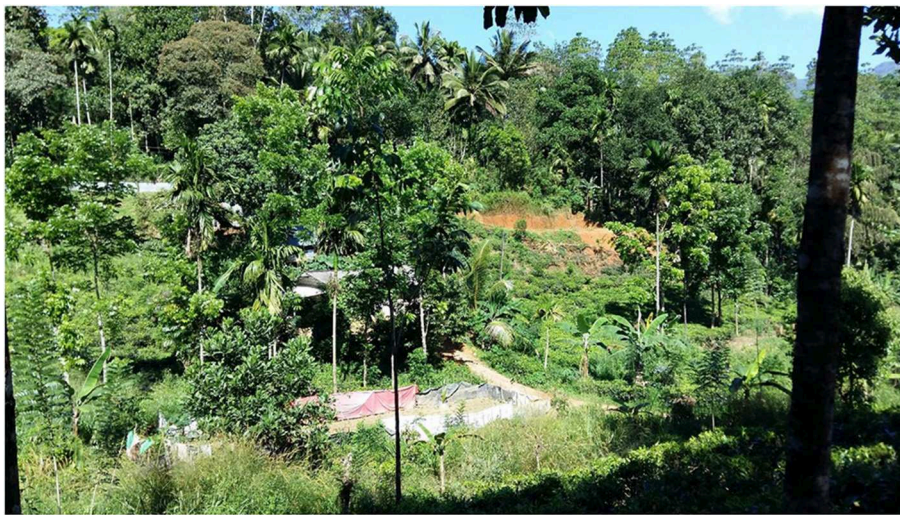
FIGURE 2 | Typical land use pattern in the study area including Kandyan Forest Garden.

is used as a shade tree, sticks used for fencing and as a support for vine crops, leaves used as a green manure). These species also occupied different layers of the canopy and therefore, represented and contributed to the diversity of homegardens in the study area.