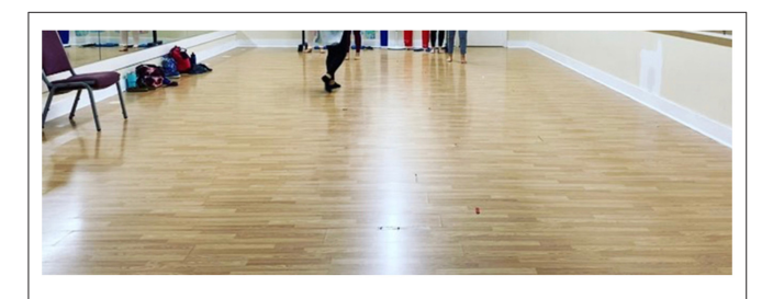
FIGURE 3 | "This is the floor I do both pointe and ballet on as well as modern. It's a wooden surface for the use of nice slides and movements. With socks on the floor can be slippery like all wooden floors are with socks but overall, this is my favorite type of floor to do turns and slides on." (Sarah, PT2).

different movements in PA that I've used in my personal life" (Alisha, ODR).