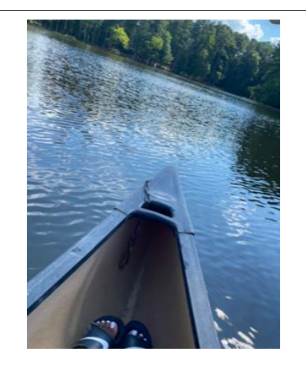
FIGURE 5 | "Physical activity facilities nearby: One of the physical activity facilities near me is a park where you can canoe and kayak. This is really important to me because my family loves doing outside activities." (Julia, PT1).