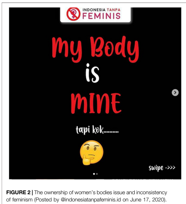
FIGURE 2 | The ownership of women's bodies issue and inconsistency of feminism (Posted by @indonesiatanpafeminis.id on June 17, 2020).