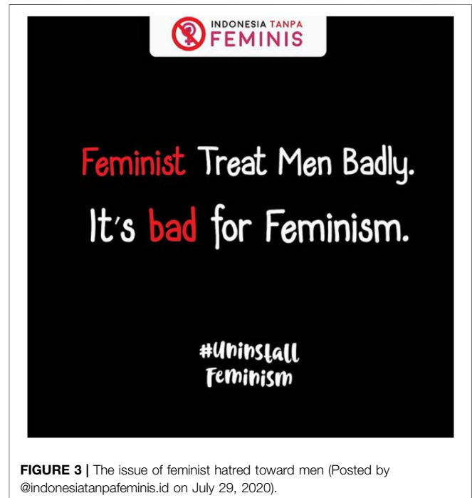
FIGURE 3 | The issue of feminist hatred toward men (Posted by @indonesiatanpafeminis.id on July 29, 2020).

that it forces women to do the same things regardless of women's physical limitations.