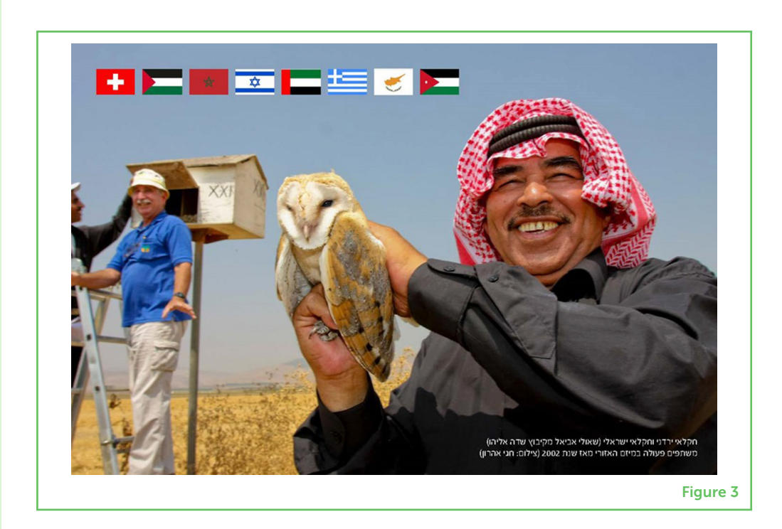
In 2015, the project was expanded to include Cyprus, Greece, in 2021 Morocco joined, —even the United Arab Emirates are planning to join soon. In Cyprus, the hunting of wild animals and migratory birds is very common, as is the use of pesticides; and even in Greece the situation is far from ideal. Hopefully, the barn owl project

A Jordanian farmer and an Israeli farmer have been collaborating in a regional barn owl project since 2002. The flags along the top of the photo represent the countries currently participating in the project: Israel, Jordan, The Palestinian Authority, Switzerland, Greece, Cyprus, and Morocco.