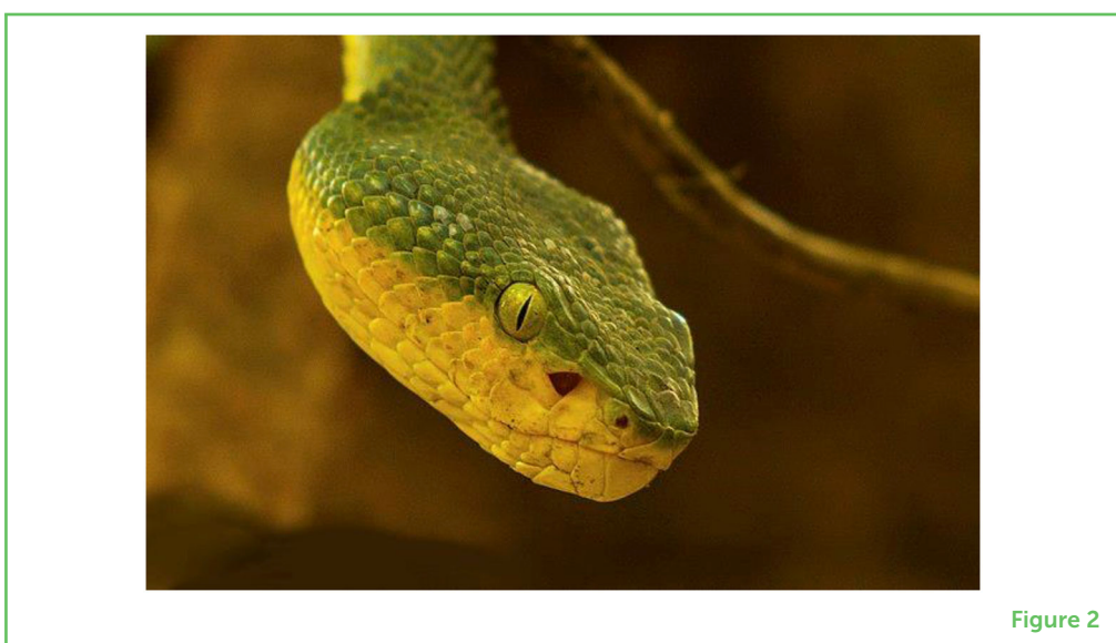
Image of Pit Viper. This image shows some characteristics of venomous snakes including the triangular head, heat-sensing pit, and elliptical pupils.