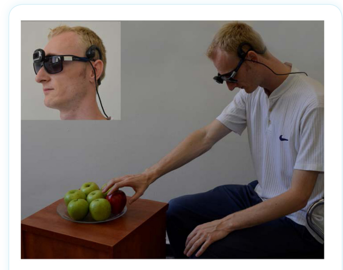
FIGURE 2 - An illustration of the EyeMusic sensory substitution device (SSD).

In another study, sighted participants moved their hands to targets that were either seen on the computer screen, or heard via the EyeMusic. It turns out that in both cases, the movements were highly accurate, and on average, their movements were off by less than 0.5 cm (0.2'). This was after very little training (as little as 25 min of experience with the EyeMusic). We anticipate that with further training, they would do even better than that. In fact, one blind long-term user of the EyeMusic was able to find a red apple in