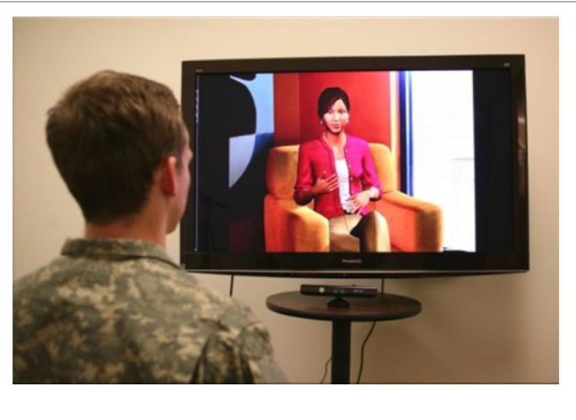
FIGURE 1 | Interview with our virtual human interviewer

To address this reluctance to disclose PTSD symptoms on the PDHA, we examine whether a new technology, namely virtual human-interviewers, can be used to increase willingness of service members to report PTSD symptoms compared to the PDHA. Virtual humans are digital representations of humans that can portray human-like characteristics and abilities and can be used to interview people in a natural way using conversational speech (see Figure 1 ). We first describe empirical work that provides a theoretical basis for how virtual human interviewers might increase the willingness of service members to report PTSD symptoms, followed by the research questions addressed in the current work. We then describe and discuss results from two studies that examine the effectiveness of virtual human interviewers designed to foster service member reporting of mental