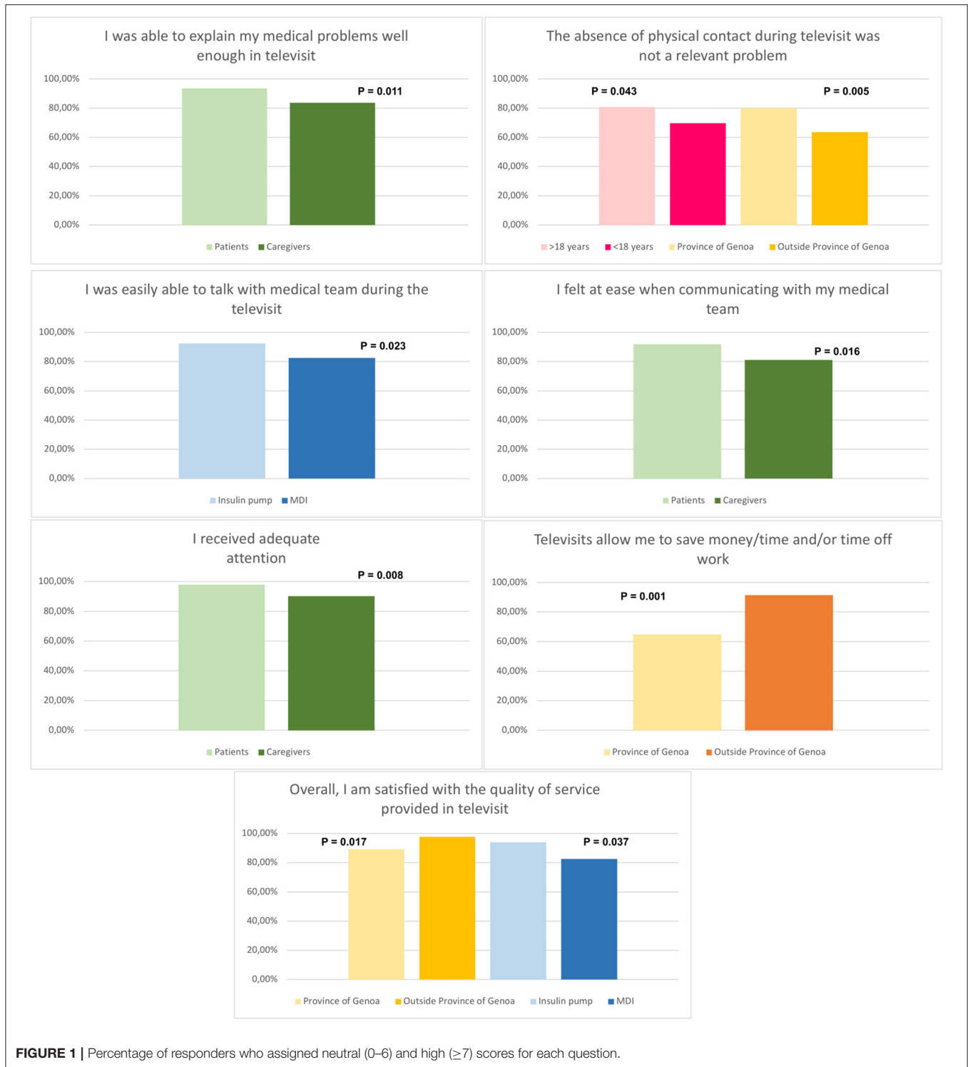
FIGURE 1 | Percentage of responders who assigned neutral (0–6) and high ( \geq 7 ) scores for each question.