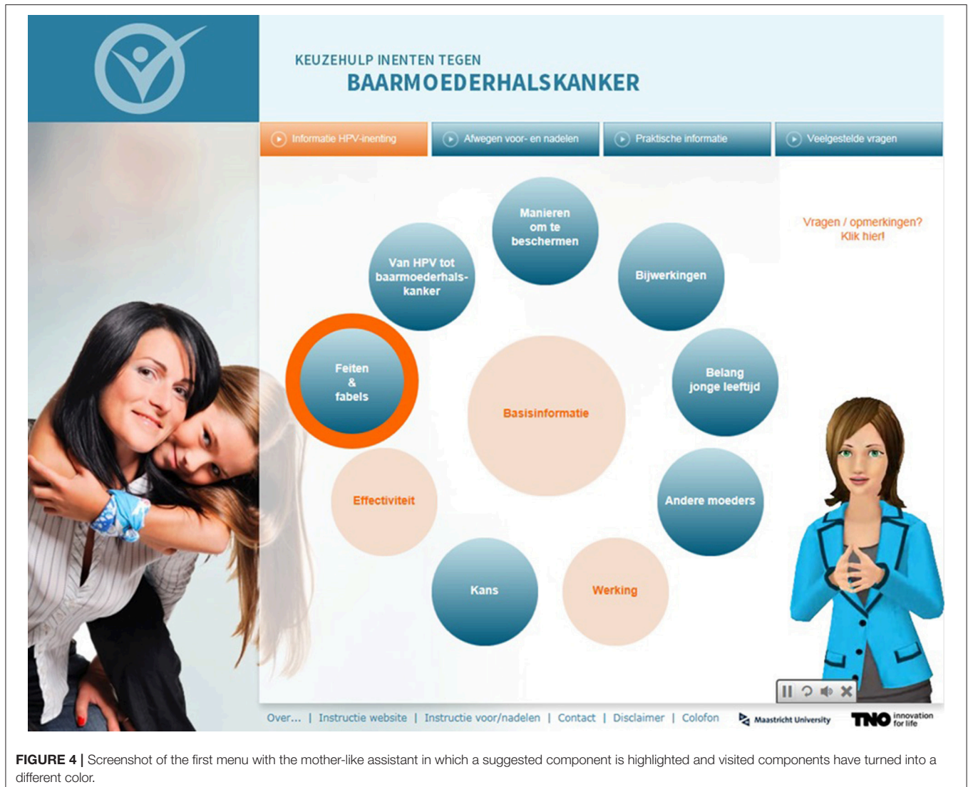
FIGURE 4 | Screenshot of the first menu with the mother-like assistant in which a suggested component is highlighted and visited components have turned into a different color.

assistants to be complex, especially in Web-based interventions in which both spoken and written feedback/information are provided.