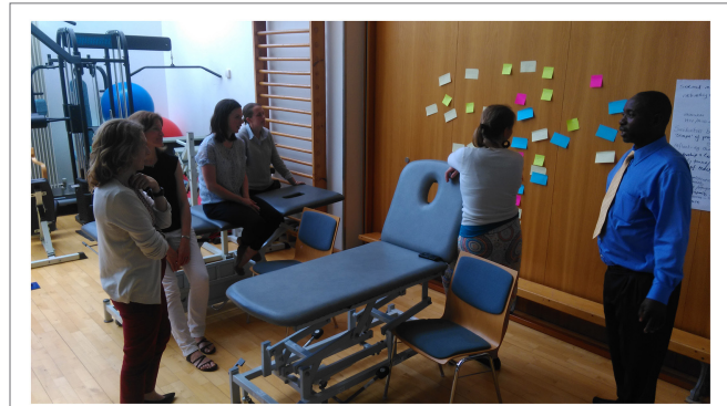
FIGURE 1 | Workshop conducted at UCD.

The project was conducted in two phases. Phase 1 took place at UCD between June 6 to June 10, 2016 and Phase 2 took place in Uganda from July 4 to July 10, 2016. Both visits had a similar schedule with workshops being conducted in the respective physiotherapy schools both in Dublin and Uganda (Figures 1 and 2). The final workshop in Uganda focused on identifying the key priorities