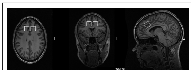
FIGURE 1 | The position of the 20-mm × 20-mm × 20-mm voxel in the midfrontal region.

The ratio of Glu to Cre were estimated by LCModel software version 6.2-1A using a simulated basis-set for a TE of 35 ms, delivered by Provencher (2011). LCModel automatically quantifies in vivo spectra, avoiding analyses of individual peaks or use of any subjective-influenced model. Estimated SD (Cramér–Rao lower bounds) below 20% were accepted, which is a rough criterion for estimates of acceptable reliability (Provencher, 2011).