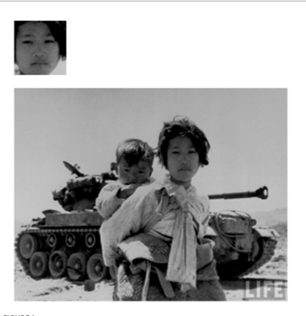
FIGURE 1 Sample stimuli with face only and face in context.

fixed, so that each photograph was randomly assigned to appear in either the FC or FO condition.