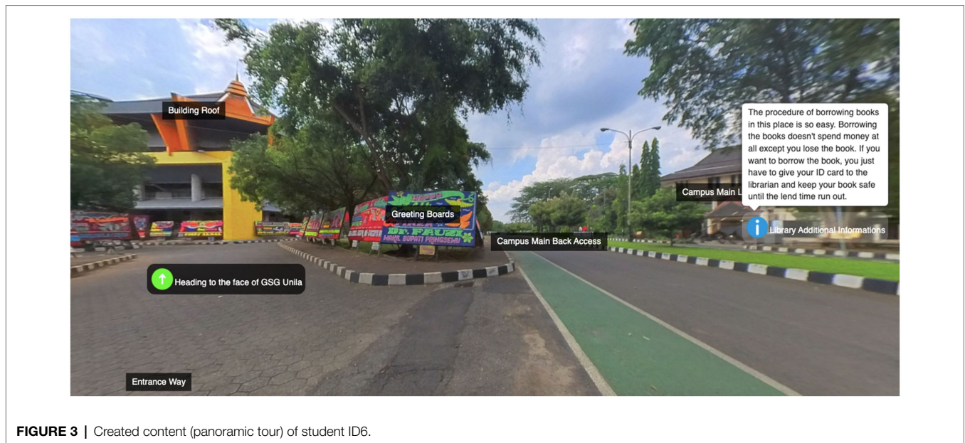
FIGURE 3 | Created content (panoramic tour) of student ID6.