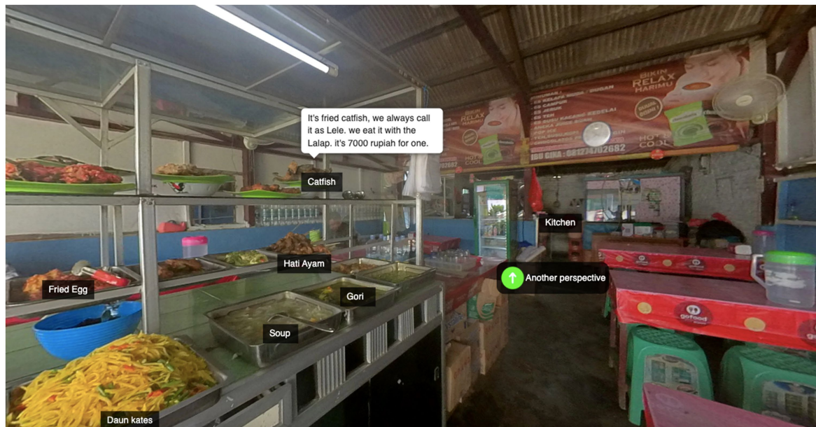
FIGURE 4 | Created content (panoramic tour) of student ID9.

To answer the fourth research question which is related to perceive learning experience to create panoramic tours, we carried out questionnaire survey with the participants. Table 7 reports the results and they show that the participants had positive perceptions of their learning experience. Their level of continuance intention to use technology for creating panoramic tours was high (total M=4.453 ; SD=0.552 ). The participants' satisfaction to use technology for creating panoramic tours was also high (total M=4.570 ; SD=0.379 ). In addition, the participants confirmed in the questionnaire that using technology for creating panoramic tours met their expectations (total M=4.400 ; SD=0.526 ). The results of the questionnaire showed that the students positively perceived their learning