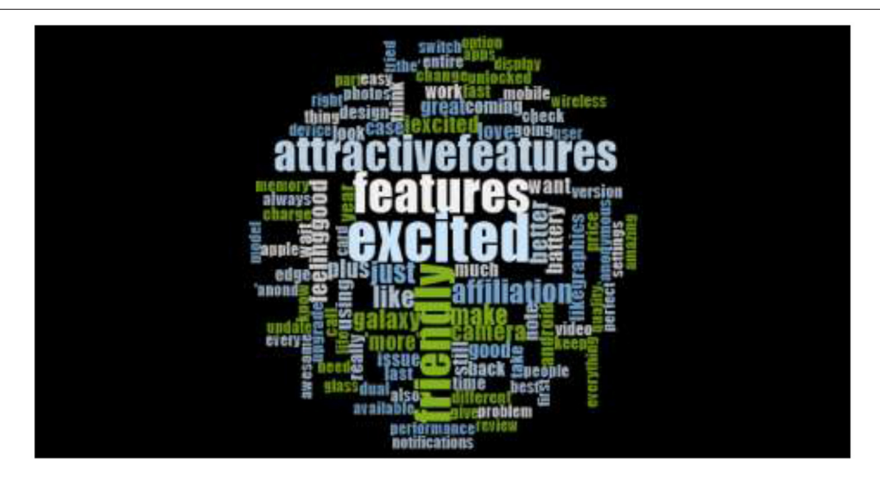
FIGURE 2 | Across the globe Consumer's Tweets word cloud for Samsung Galaxy (2017–2018).