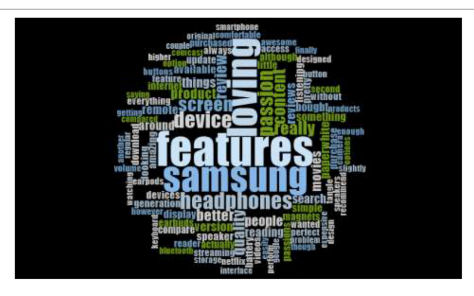
FIGURE 4 | Pakistani consumer's sentiments about Samsung galaxy (Tweets Years 2017–2018).

Nvivo 12 has generated word cloud, which is the graphical representation of words. The word cloud of current study generated with the words was having similar meaning. Word cloud has been recognized with another name tag cloud is actually visual representation of the unstructured text data. The words interpreted with their size and color. Moreover, unstructured data which is in the form of text continue to see unprecedented growth within the field of social media. Therefore, there is a need to analyze the data, which is available in massive amount. Figure 1 is describing the word cloud of data representing to the 14877 tweets of consumers regarding post purchase opinions for Samsung Galaxy. Besides, the most highlighted words like attention, cognition, and emotions are the words which are frequently used in tweets. It reveals that