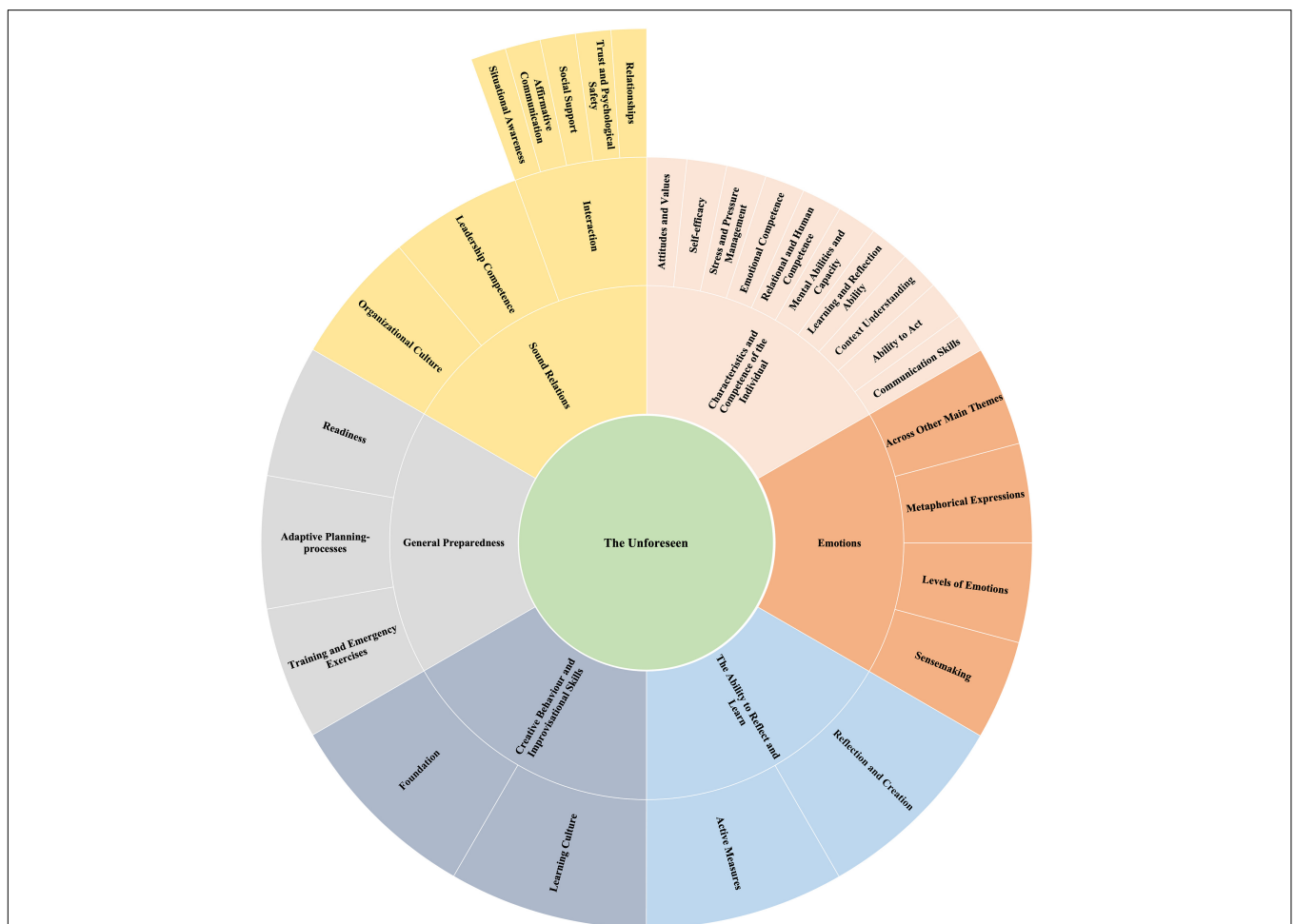
FIGURE 2 | Sunburst map of the seven main themes, including sub-themes and sub-sub-themes. The map also represents a panarchy of three adaptive cross-level cycles (Holling and Gunderson, 2002) based on the main types of competence, units of competence, and elements of competence (Burke, 1990; Truelove, 1995).

The Unforeseen emerged as the first rich and complex theme participants highlighted from their experiences and reflections, as shown in Table 3 . This was somewhat expected, as all study participants were selected because of their unique and extensive knowledge of dealing with some of the most challenging and unforeseen events that have affected Norway in recent times, including the terrorist attack of 22 July 2011. Three separate sub-themes materialized from the data. These were The Unforeseen Phenomenon , The Experience of an Unforeseen Event , and Temporary Shortcomings .