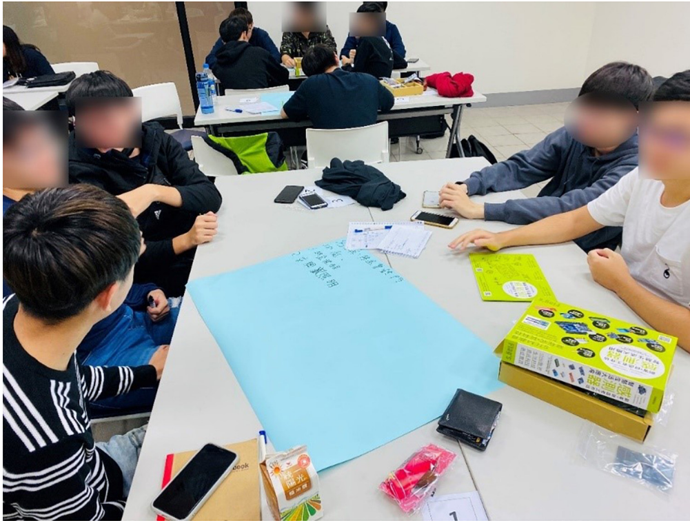
FIGURE 2 | Write individual ideas or shared memos.

summary conversation results and topics to classmates in 5 min. The presentation is shown in Figure 3 .