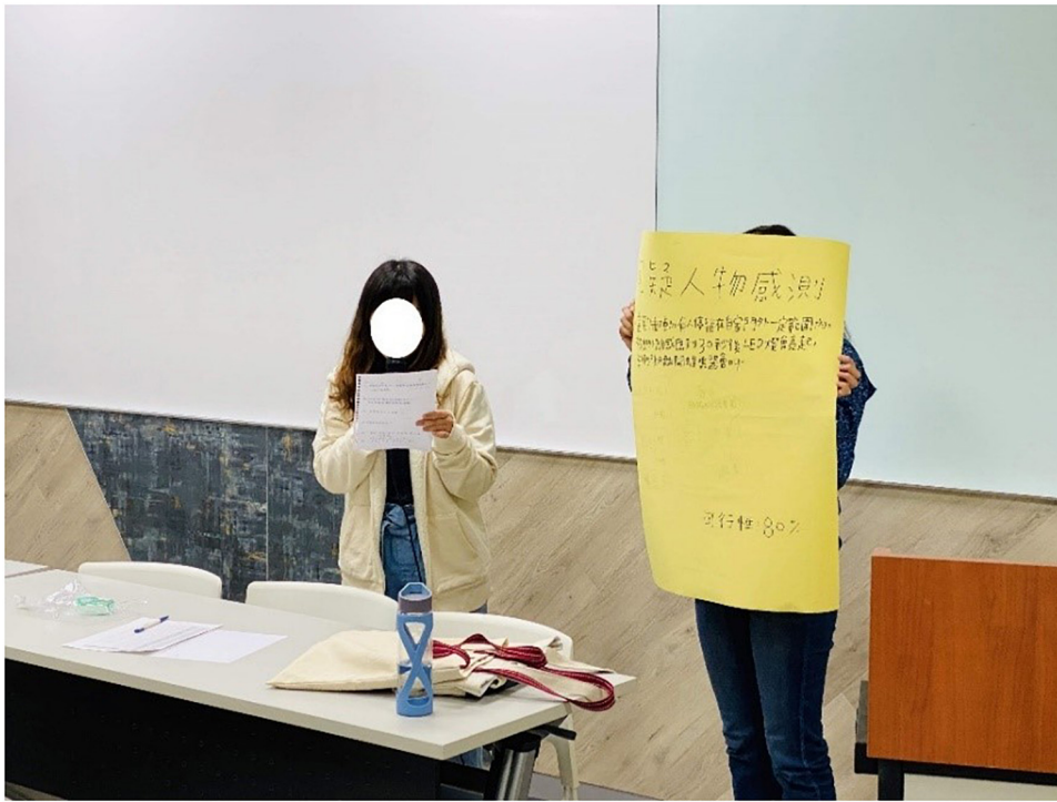
FIGURE 3 | Present the results of the conversation to classmates.

scale, with 5 points indicating “strongly agree” and 1 point indicating “strongly disagree.” In addition, the Cronbach alpha consistency coefficient calculated for the CTS scale is 0.822 (Korkmaz et al., 2017).