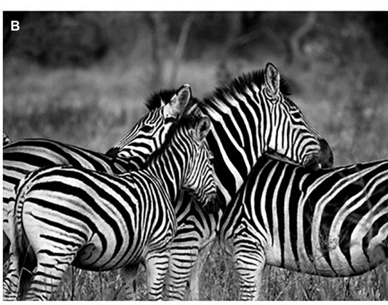
FIGURE 3 | Are Gabor patches simple or complex compared to a picture of zebras? (A) A Gabor patch. (B) A photograph of zebras. The uniquely striped patterns of the zebra makes them most familiar to humans, whereas the question why zebras have such beautiful stripes remains the topic of much discussion among biologists, see e.g., Caro and Stankowich (2015) and Larison et al. (2015). Copyright statement – Images are used under the provision of the "fair use" U.S. Copyright Act 107 and Dutch Copyright Law Article 15a for non-profit purposes of research, education and scholarly comment. Image of Gabor patch was adapted from Todorović (2016, May 30). Retrieved April 1, 2020, from http://neuroanatody.com/2016/05/whats-in-a-gabor-patch/). Photograph of zebras was made by Ajay Lalu and has been made publicly available by the owner for non-profit purposes via Pixabay. Retrieved on April 1, 2020, from https://pixabay.com/nl/users/ajaylalu-1897335/.

properties are considered to be a good representation of the receptive field profiles in the primary visual cortex. While Gabor patches may be considered 'simple' to researchers who study the relation between low-level visual processing and neural activity in terms of orientation-tuning and hemodynamic response functions, they also point to the yet to be explained 'complexity' of the many possible relations between other cognitive processes and patterns of neural activity in the brain. On the other hand, a naïve participant (who likely has no clue about what researchers have discovered about low-level visual processing) may describe these Gabor patches as blurry, kind of stripy, zebra-like circles, and think that they are incredibly boring to look at for many trials while lying quietly in a MRI scanner.