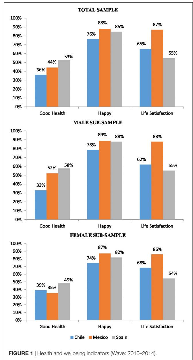
FIGURE 1 | Health and wellbeing indicators (Wave: 2010–2014).

categories: (1) Social awareness: activities related to human rights or environmental and animal conservation; (2) Professional and Political: activities related to trade unions, political parties, and professional associations; (3) Education and Leisure: activities related to education, culture, youth work, sports, or leisure; (4) Religion: activities in churches or religious organizations. The rewards of volunteering depend on the volunteers' motivation, which might be basically classified as intrinsic motivation and