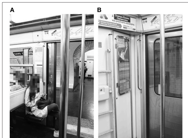
FIGURE 2 | Failing to take a seat because there is someone already sitting in the next seat (A). Deborah prefers to stand in the corner (B). The participants to the study have given their agreement in writing for the publication of images from their subcam recordings, such as the above, provided they are not individually identifiable on the picture. Images have been blurred to ensure anonymity.

T, Typical behavior; AT, Atypical behavior; ?, ambiguous behavior. The numbers indicate ratings of each rater's response choices in each situation.