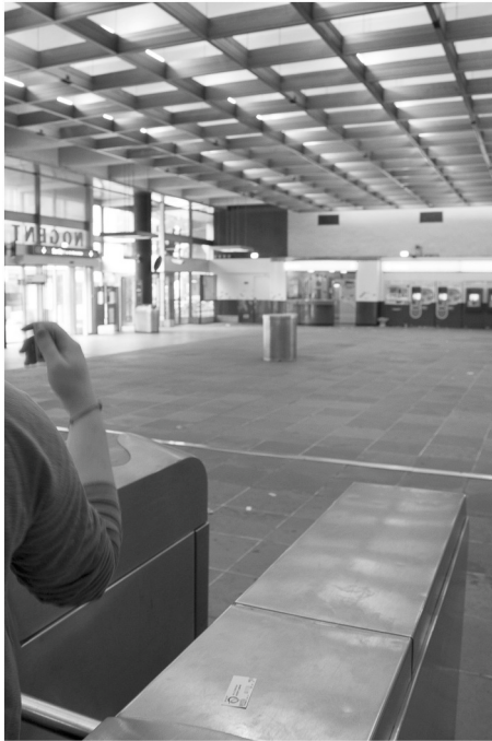
FIGURE 3 | A woman with obesity passing sideways through the turnstile. The participants to the study have given their agreement in writing for the publication of images from their subcam recordings, such as the above, provided they are not individually identifiable on the picture. Images have been blurred to ensure anonymity.

making sharp or fast maneuvers and generally navigated in a way that left ample space between them and obstacles or other people. Observed behavior of women with overweight status who had surgery (S-OW-4, S-OW-8) depended on the participant, being typical for some and atypical for others (see Appendix C ). For example, Kerry (S-OW-4) showed atypical behavior, walking for 25 s behind a rather slow woman, before passing her although there was ample space on the right to pass her by. Viewers with normal weight (e.g., raters) mentioned they felt somewhat impatient while watching the tape. Kerry herself also mentioned in her RIW her slower and more cautious pace in navigation. However, this behavior was not systematic or constant among ex-obese women (who were overweight at the time of the study).