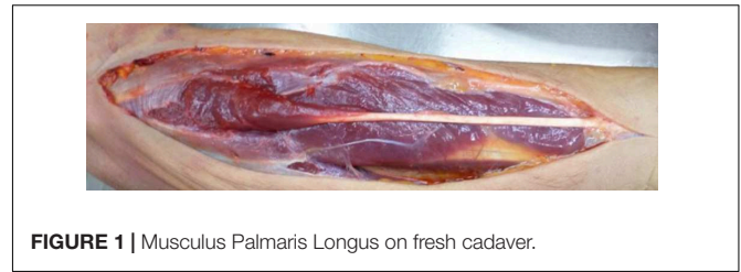
FIGURE 1 | Musculus Palmaris Longus on fresh cadaver.

Materials consisted of 42 hands and forearms of 21 healthy individuals. All the participants signed the form of informed consent and had opportunity to ask any questions they deemed relevant. The group of 11 keyboard musicians (aged 19–38) had their PL's morphology examined first by Schaeffer's test and then by an ultrasound imaging. Their hand grip strength and selectively the first and fifth finger opposition strength was measured by digital dynamometer (KERN MAP 80K1S) before and after a 15 min piano playing test designed especially for the sake of this study. The piano playing test consisted