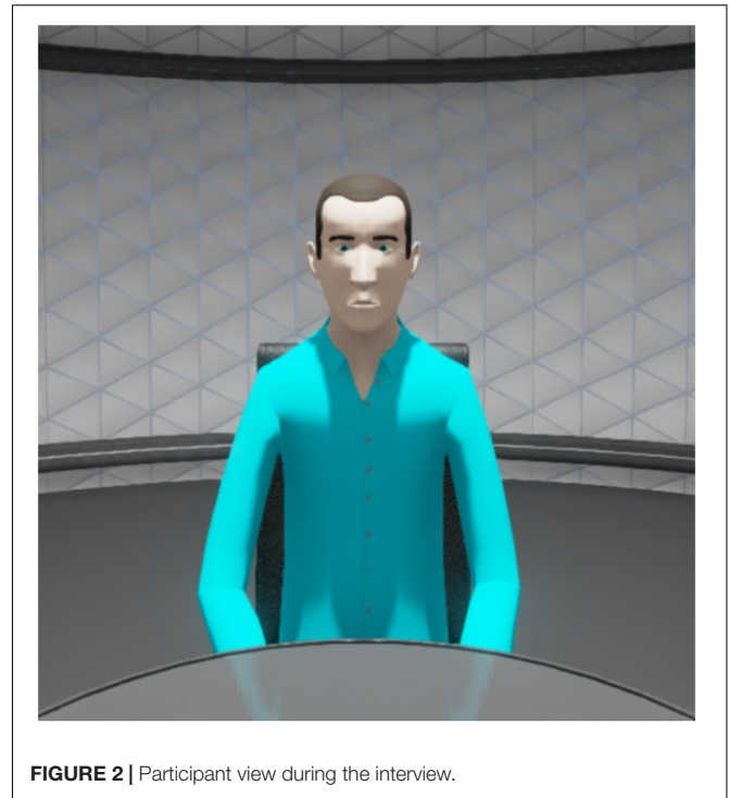
FIGURE 2 | Participant view during the interview.

Interviews were transcribed and coded according to a scoring template technique (e.g., Memon et al., 1996). Each item recalled