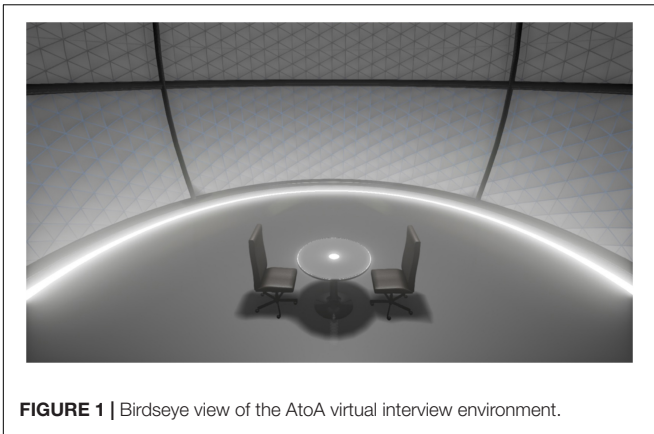
FIGURE 1 | Birdseye view of the AtoA virtual interview environment.

avatar participant (see Figure 1 ). Participants did not experience complete embodiment, but head movements were tracked, and so were experienced by participants.