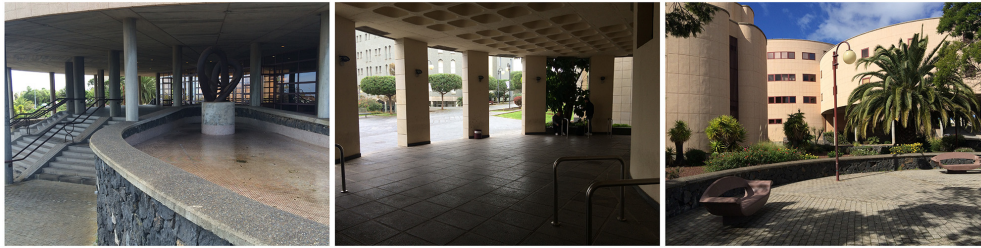
FIGURE 1 | Photographs of places with a low level of restorativeness.