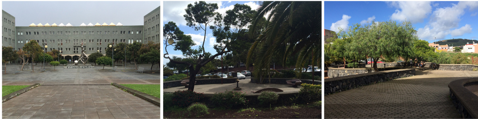
FIGURE 2 | Photographs of places with a medium level of restorativeness.