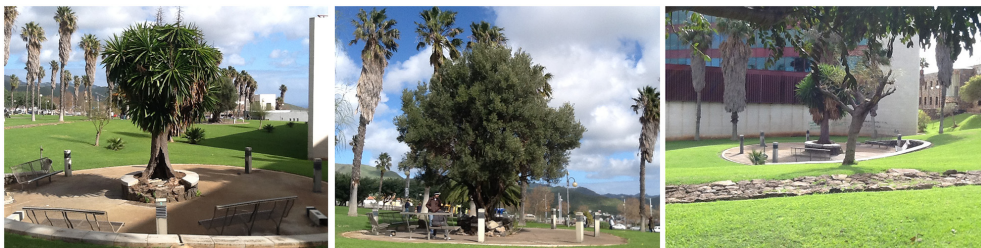
FIGURE 3 | Photographs of places with a high level of restorativeness.