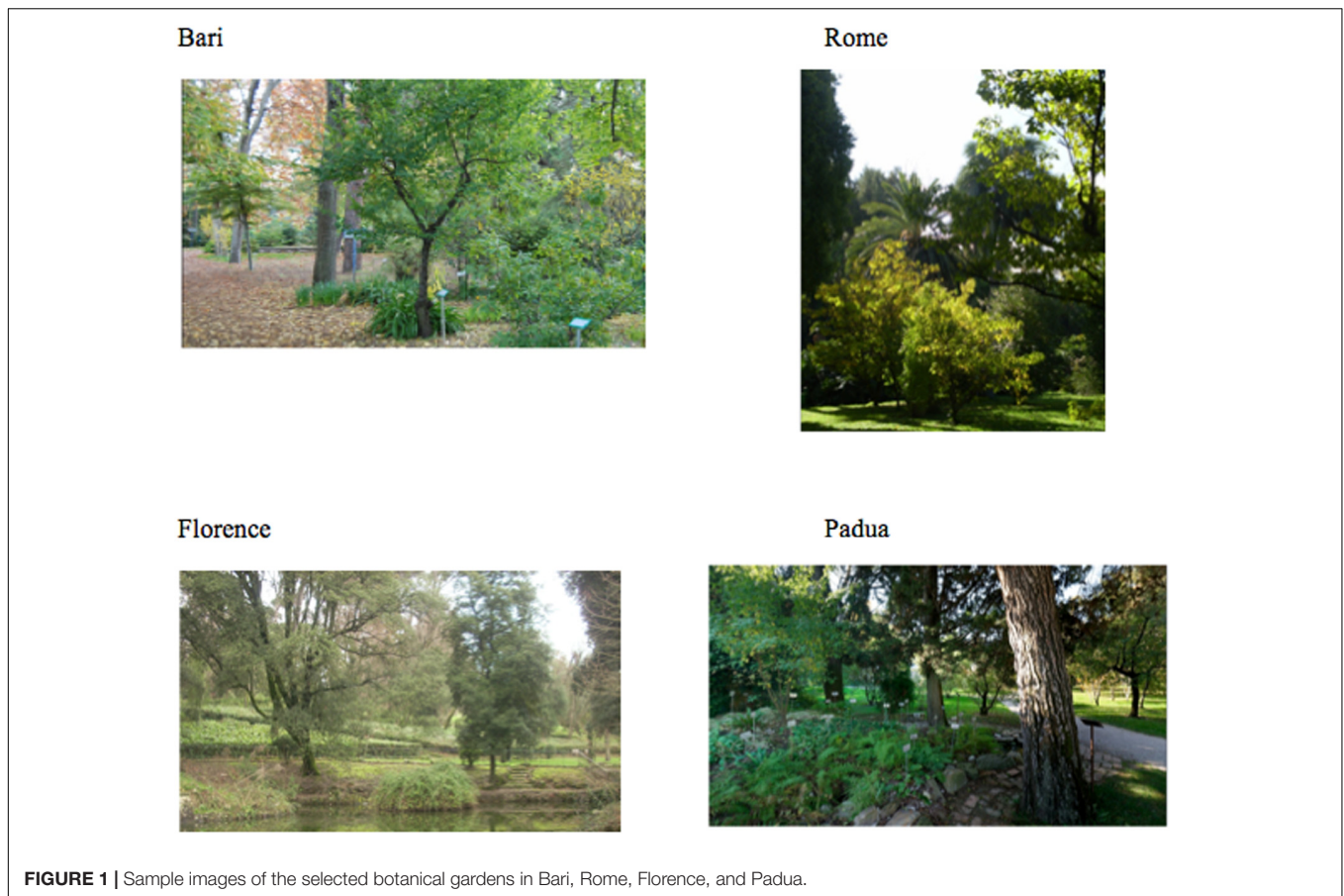
FIGURE 1 | Sample images of the selected botanical gardens in Bari, Rome, Florence, and Padua.