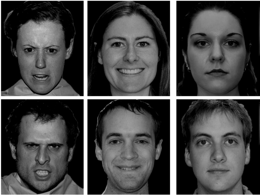
FIGURE 3 | Examples of Caucasian faces.