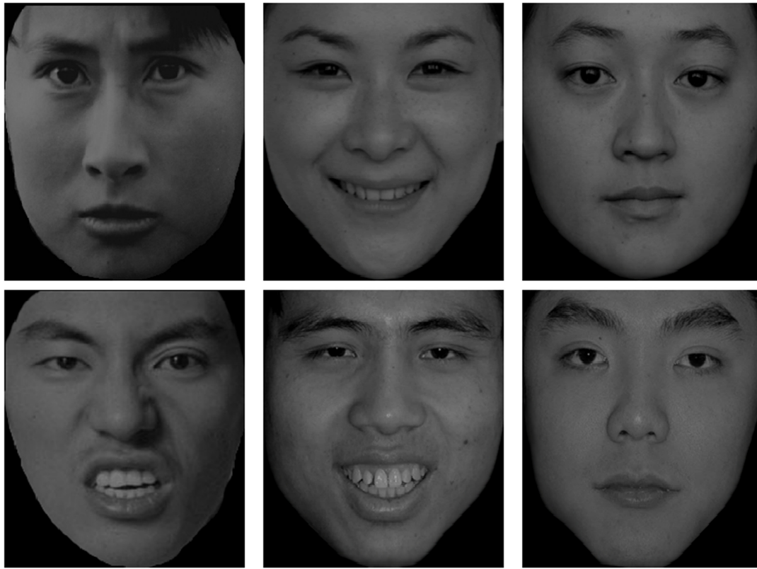
FIGURE 2 | Examples of Chinese faces.

stimulus repetition (twice), face gender (male or female), and facial emotion (happy, angry, or neutral). Faces of all conditions were presented in a randomized order. Participants were given a practice block of 36 trials at the start of the experiment. There were two self-paced breaks in the experiment.