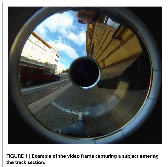
FIGURE 1 | Example of the video frame capturing a subject entering the track section.

The selected musical pieces were used in Music B at the original tempo. Music A was 8% slower, music C was 8% faster.