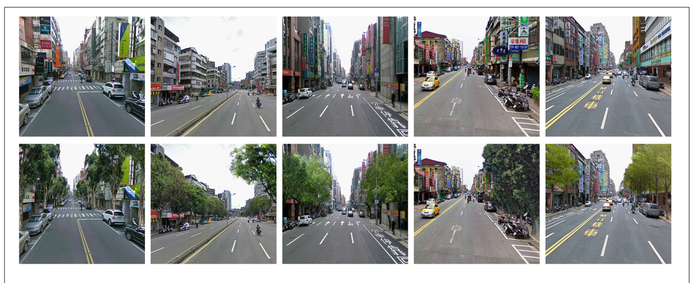
FIGURE 1 | Streetscape images. (Upper row, streetscape with no greenery; Lower row, streetscape with simulated greenery).

Following the between-subject design, participants were randomly assigned to one of four groups with differing greenery images and awareness levels: (a) The No Trees group was shown streetscape images with no greenery. The awareness level for this group was none. (b) The Minimal Awareness group was shown the same images but mixed with rapid flashes of simulated