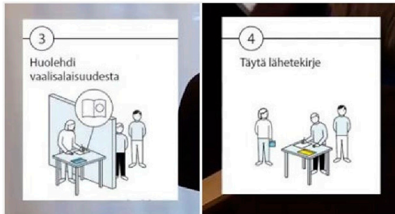
FIGURE 2 | Image instructions on the postal voting instruction film.

out to mark the ballot. Next, we see them standing close to the seated voter showing the cover letter to the witnesses, who subsequently sign it. Interestingly, the image instruction appearing on the screen ( Figure 2 ) places the witnesses behind a wall, possibly indicating another room for the time when the ballot is being marked. Either way, ballot secrecy and electoral freedom seem to be simultaneously emphasized by the prominence of the witnesses in the film and taken for granted by the implicitness of what the witnesses are expected to observe. It remains unclear if the witnesses are supposed to check that the ballot is unmarked at the beginning of the event (for if it is not, they cannot really know under what kind of conditions it has been marked). The voter on the film shows the empty ballot to the camera but it is as though this sequence takes place before the entry of the witnesses.