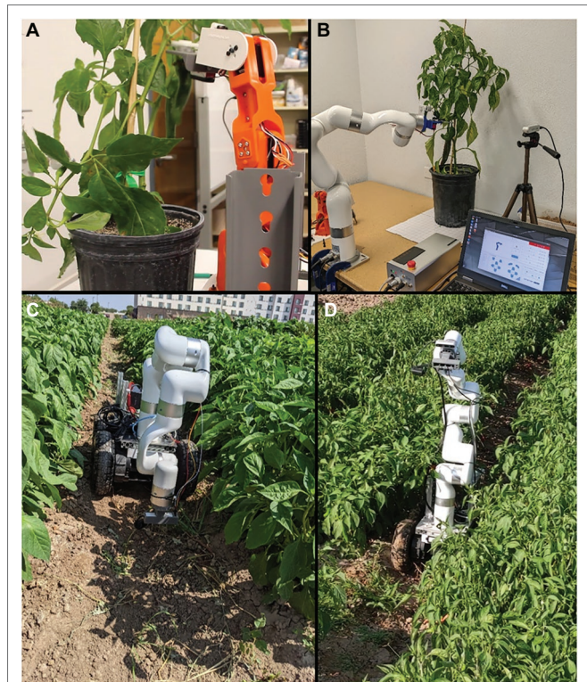
FIGURE 3 | (A) A 5 degrees of freedom (DoF) robotic arm with a cutter end-effector harvesting green chile peppers in an indoor setting. (B) A 6 DoF robotic arm with integrated wrist camera and a cutter end-effector identifies the location of the stem and harvest green chile pepper. (C) Robotic soil moisture and temperature measurements at the NMSU's Jose Fernandez Heritage Farm, Las Cruces, NM. (D) Image capturing and visual remote sensing using an autonomous ground mobile robotic arm in chile pepper testing field at the Leyendecker Plant Science Research Center, NMSU, Las Cruces, NM.

In another work, a robotic arm with sensors attached to a ground rover robot have been used for performing direct soil moisture-temperature measurements ( Figure 3C ) and remote visual sensing (image capturing using an RGB + D camera; Figure 3D ) in chile pepper farms. The moisture sensor probe is inserted into the soil at multiple points along the rows of the chile pepper for measuring moisture level and temperature. Additionally, the camera attached to the wrist of the robotic arm takes RGB and infrared images from the plant and local soil for the visual analysis of the plant and soil’s health and physiological conditions through AI-enabled machine algorithms. Preliminary observations showed the exciting potential of the robotic system for collecting environmental data with a higher resolution for the spatial and temporal aspects of the targeted areas for determination of soil and plant stresses. The advantages of using ground robots over aerial systems include longer operation time, higher payload for carrying a variety of sensors for multimodal sensing, and less dependency to weather conditions. The multimodal data will be used to map the environment and crops’ heterogeneous conditions that could be used for data-driven precision agriculture in chile pepper.