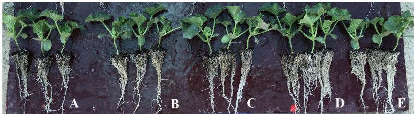
FIGURE 1 | Twelve-day-old plants of melon treated with 0 (A), 0.06 (B), 0.12 (C), 0.24 (D), or 0.48 (E) mL plant -1 of biopolymer-based biostimulant.

Q, quadratic; NS, **Non-significant or significant at P \leq 0.01 , respectively. R^2 = coefficient of determination for quadratic regression model. Different letters within each column indicate significant differences according to Duncan's multiple range test ( P = 0.05 ).