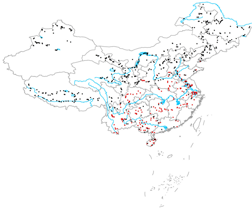
FIGURE 1 | Geographical locations of the sampling sites (red circles show the communities in which at least one exotic plant was present and black circles show the communities that did not have exotic plants).

represent the actual community structure. For each quadrant, the relative coverage of the native plants ( C ) was determined by visual estimation, and all native plants (including emergent and submerged parts and roots) and vegetative propagules in the quadrants were collected, washed, and dried at 70^{\circ}\text{C} for >48 h to determine the total biomass ( M ). The mean relative coverage of native plants in the community ( C_n ) was calculated as follows: