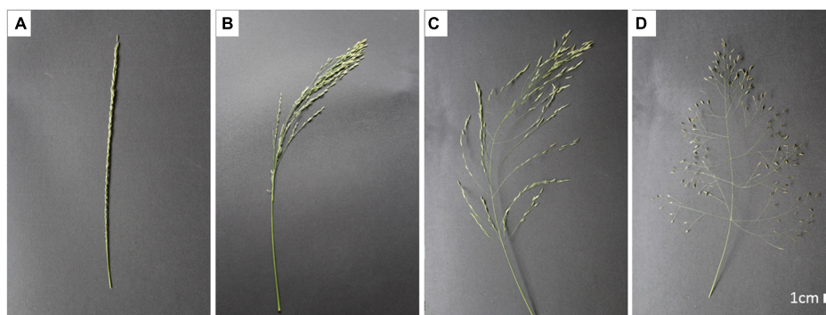
FIGURE 1 | Diversity in the form of tef panicles. (A) Very compact, (B) semi-compact, (C) fairly loose, (D) very loose.

Significant clinal diversity was reported in tef germplasm populations collected from different altitudinal zones for traits such as days to maturity, number of culm nodes, first and second basal culm internode diameter, and harvest index (Assefa et al., 2001b). Likewise, significant altitude-based diversity in tef germplasm