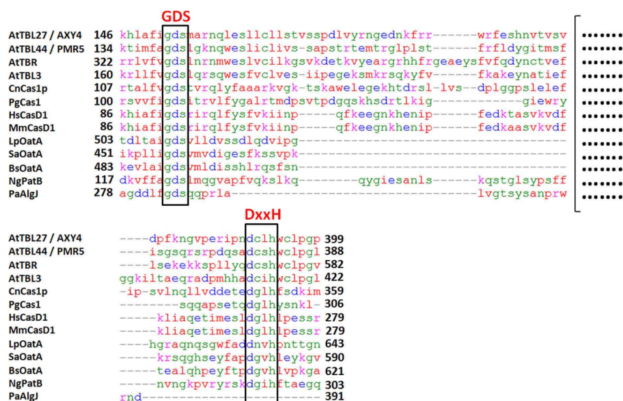
FIGURE 2 | Protein sequence alignment of domains containing the GDS and DxxH motifs of proteins displayed in Figure 1. Alignment was performed using Kalign 2.0 (Lassmann and Sonnhammer, 2005). (Format: ClustalW, Gap open penalty: 30, Gap extension penalty: 0.2, Terminal Gap penalties: 0.45, Bonus score: 0). Proteins were trimmed to the amino acid residues given in bold numbers for the alignment. At, Arabidopsis thaliana ;

It thus appears that the O -acetylation mechanism is highly conserved among organisms and kingdoms. However, while in some organisms the responsible protein remains conserved as a single protein (mammals, fungi, Gram-positive bacteria) in other organisms this protein is split into two (Gram-negative bacteria, plants) or three proteins ( Pseudomonas ). Such a split allows the diversification of the proteins. For example, in plants there are four RWA and 46 TBL proteins perhaps reflecting the diversity of acetylated substrates and specificity in the various tissues and/or developmental stages. It has been proposed that the proteins harboring the multiple transmembrane domains such as PatA and AlgI are involved in translocation of an acetyl-donor molecule across the membrane (Franklin and Ohman, 2002), while the loop proteins PatB and AlgJ can be considered putative O -acetyltransferases that transfer the acetyl-group to the polysaccharide. By analogy in plants RWA would be an acetyl-donor translocator and the TBL proteins would represent the polysaccharide specific O -acetyltransferases