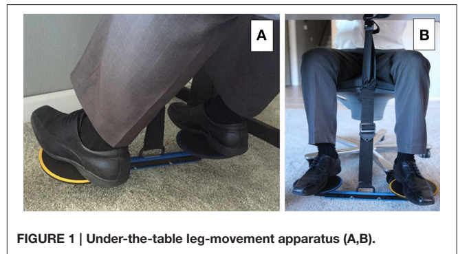
FIGURE 1 | Under-the-table leg-movement apparatus (A,B).

The pendulum is constructed from a 5-cm-wide nylon webbed strap and is adjustable from approximately 20 to 70 cm. At the