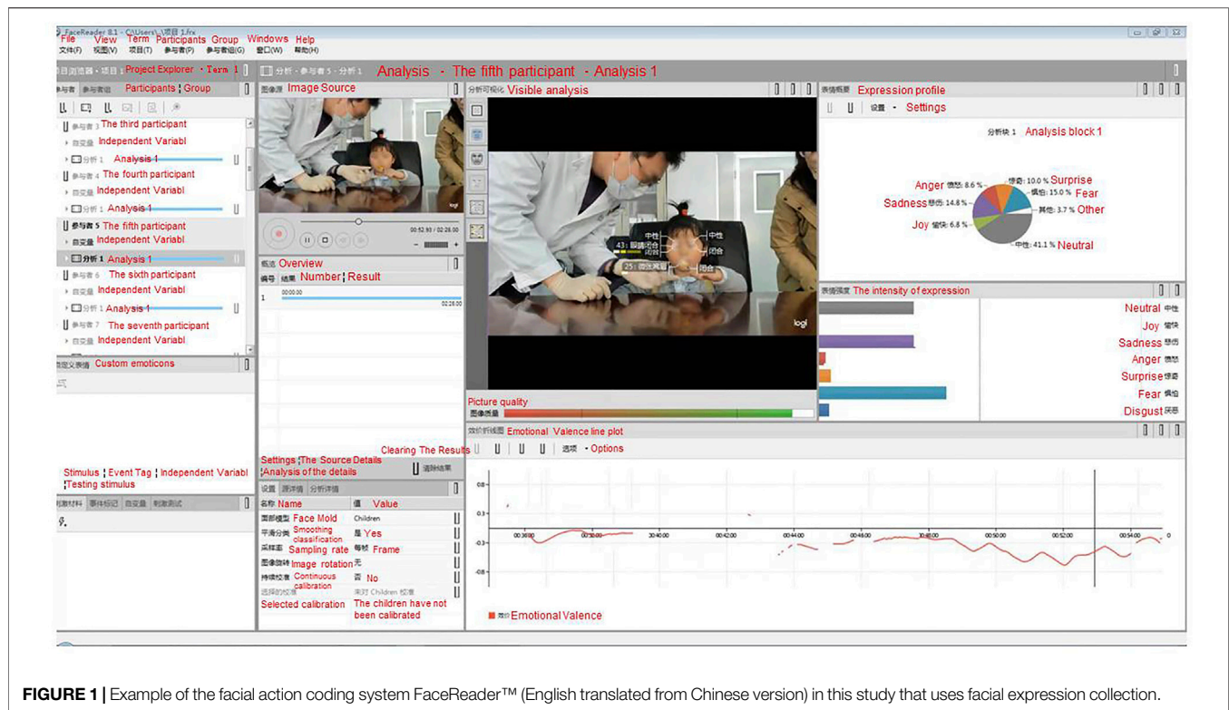
FIGURE 1 | Example of the facial action coding system FaceReader™ (English translated from Chinese version) in this study that uses facial expression collection.