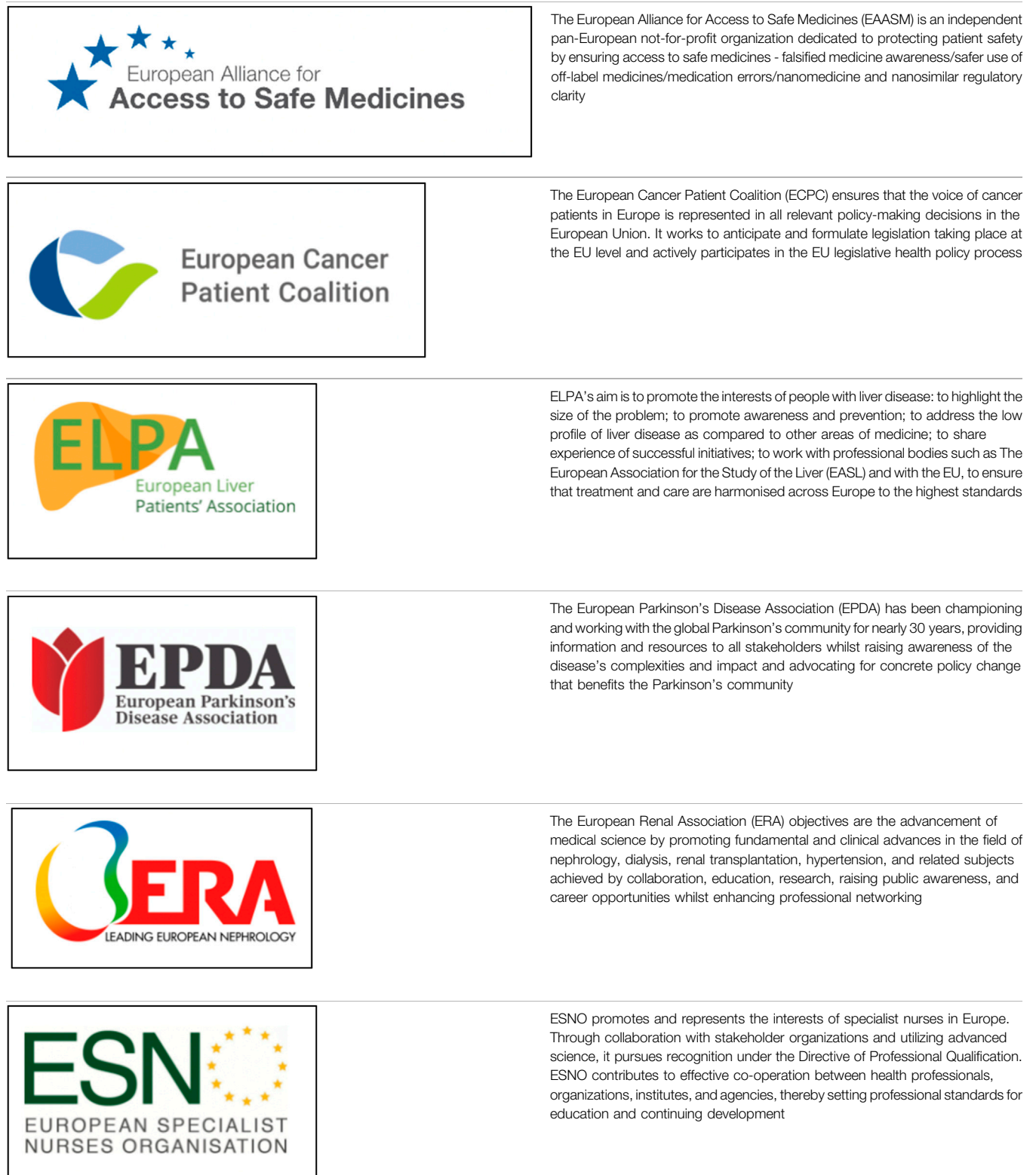
TABLE 3 | Nanomedicines Regulatory Coalition.