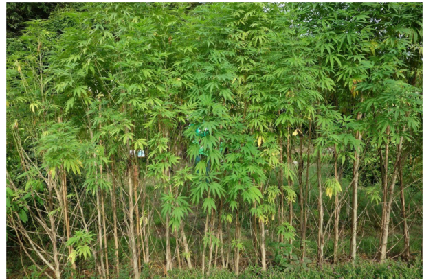
FIGURE 2 | Broad-leaflet hemp in Guangxi province, China.

Recent archeological evidence from a 2700 year old tomb discovered in the Yanghai region of China’s Xinjiang province suggests that drug biotypes of cannabis were known to the ancient inhabitants of the region (Jiang et al., 2006), and genetic