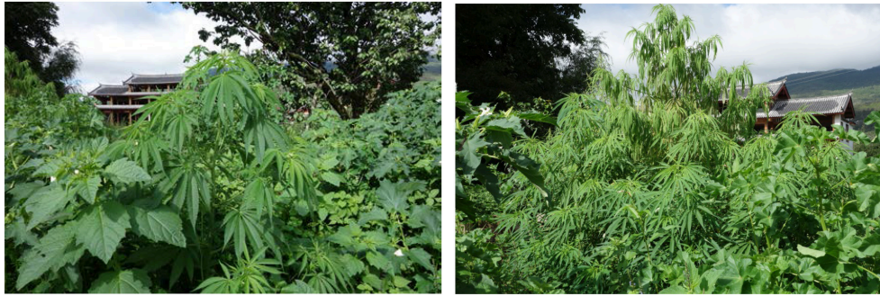
FIGURE 3 | Feral cannabis in Yunnan province, China.

distinctions are genetically determined, the long-term and abundant cultivation of fiber-rich biotypes in China likely supplanted or diluted any drug biotypes that were once present. However, the timeline of this process has been poorly elucidated, and bencao literature suggests that drug effects of cannabis were recognized in Chinese medicine from ancient times up through Ming dynasty texts written in the sixteenth century AD. This curious anomaly suggests that the evolution of Chinese cannabis biotypes may have taken place gradually, and merits further investigation to determine if bencao literature can help to clarify when fiber and drug biotypes diverged in ancient China, and the implications of such a divergence on its medical applications.