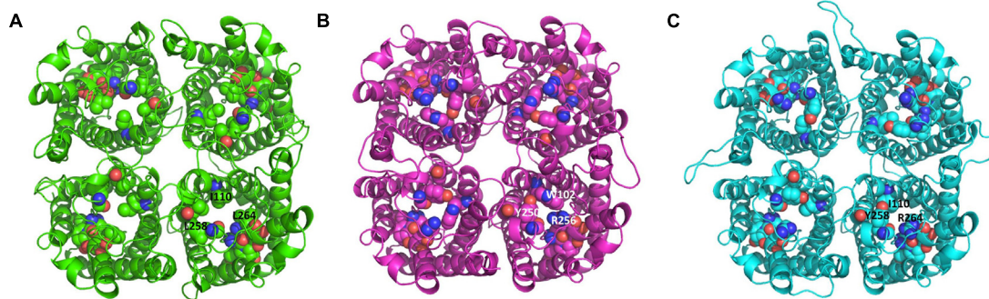
FIGURE 3 | Extracellular top view of the tetrameric structures.

(A) TbAQP2; the residues constituting the NSA, NPS, and IVLL motif are shown in space-filling models and the locations of Ile110, Leu258, and Leu 264 are indicated in one subunit. (B) TbAQP3; the residues constituting the two NPA and WGYR motif are shown in space-filling models and the locations of Trp102, Tyr250, and Arg256 are indicated in one subunit. (C) TbAQP2-3 (569–841) ; the residues constituting the NSA, NPS, and IGYR motif are shown in space-filling models and the locations of Ile110, Tyr258, and Arg264 are indicated in one subunit. The