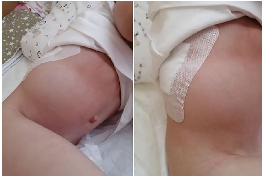
FIGURE 3 Pseudohermia in a patient in a postoperative period.

was no presence of free fluid or air in the abdominal cavity, according to MSCT.