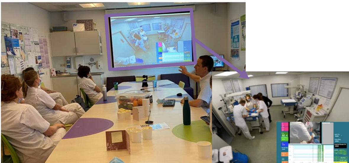
FIGURE 2 Video-reflection of a neonatal resuscitation from 2021 onward. Recordings of the hands of the caregivers, the respiratory function monitor and the resuscitation room are visible, with addition of audio. During the video-reflexive sessions, the focus is on the context.