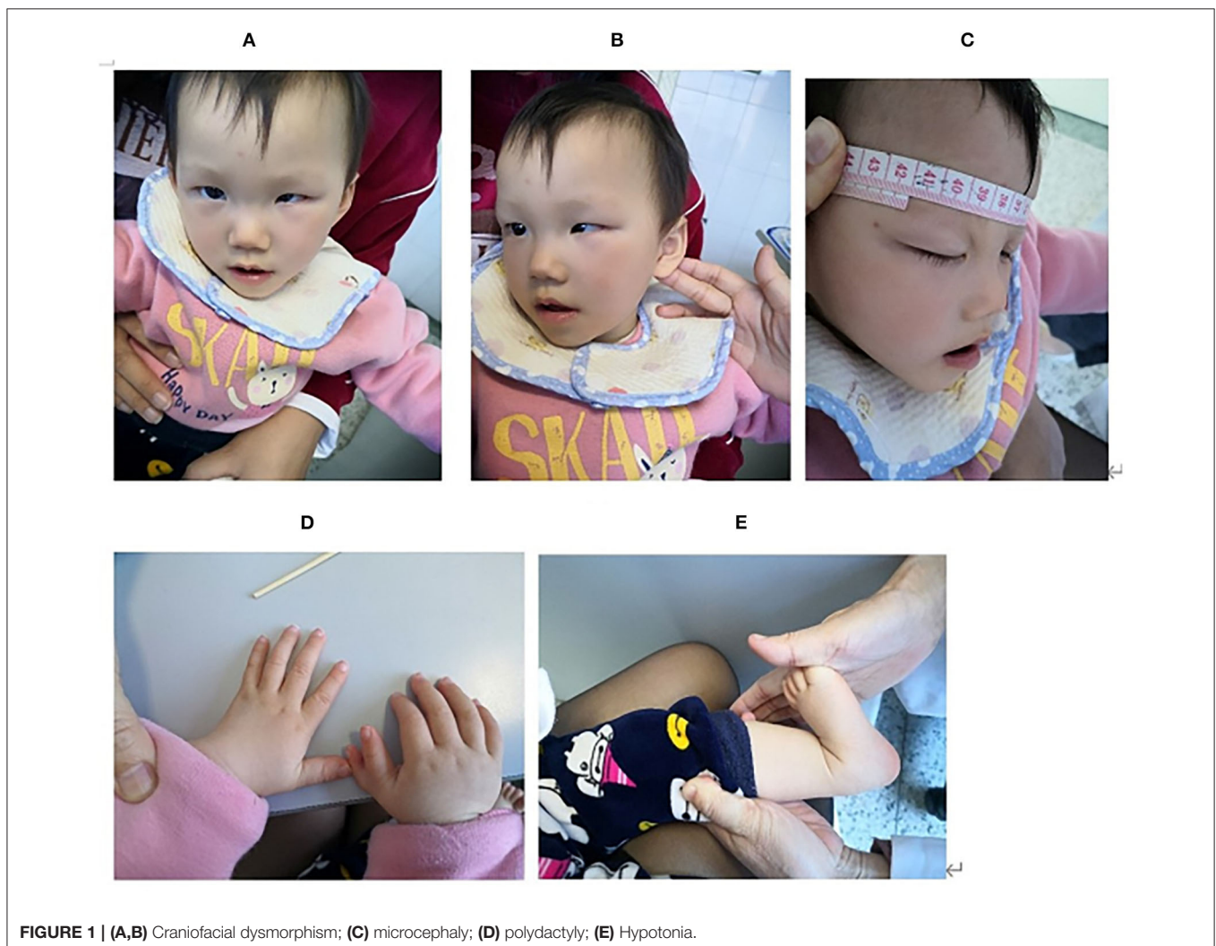
FIGURE 1 | (A,B) Craniofacial dysmorphism; (C) microcephaly; (D) polydactyly; (E) Hypotonia.

the age of 4 months, she had an ophthalmologic examination and was found blindness in the left eye when her parents wanted to treat strabismus her left eye. Ultrasonic examination showed a retinal detachment in the left eye. Fortunately, her right eye was normal. The patient was evaluated in our department at 15 months. She can raise her head but unstably, and still can't sit. The language barrier is very serious. She can make some sounds, but she can't speak. Her parents found her intelligence lower than her peers. Physical examination showed as follows: weight 7.5 kg (−2.46 SD), height 72.5 cm (−2.29 SD), occipitofrontal circumference (OFC) 41 cm (−4.17 SD), anterior frontal was closure, light hair color, fair skin, low set ears, flat nasal bridge, strabismus in the left eye, thin upper lip, polydactyly in the right hand, but the foot does not have polydactylous. The systolic murmur of grade 2/6 can be heard in the 3–4 intercostals of the precordial area. The lung and abdomen are normal. The tension of trunk and peripheral limbs decreased significantly. Bilateral tendon reflexes were weakened, Babbitt's sign was negative, and no sign of spastic paralysis ( Figures 1A–E ). Auxiliary examination: the whole blood count, urine routine test,