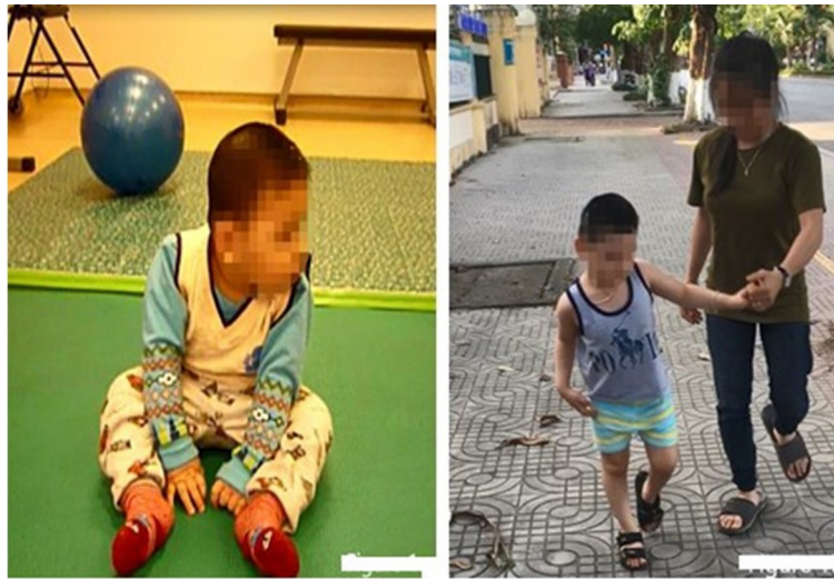
FIGURE 1 | The improvement of motor functions and muscle tone in Case 1 before and after stem cell transplantation.